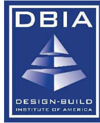
Exhibit D Insurance Requirements and Instructions

This document has important legal consequences. Consultation with an attorney is recommended with respect to its completion or modification.